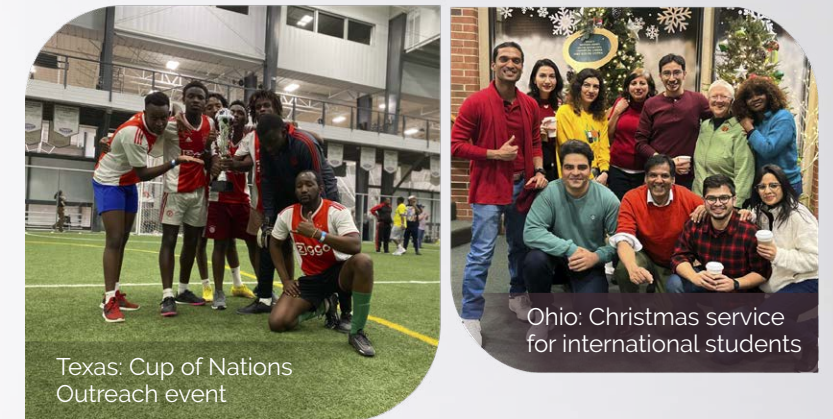
Texas: Cup of Nations Outreach event