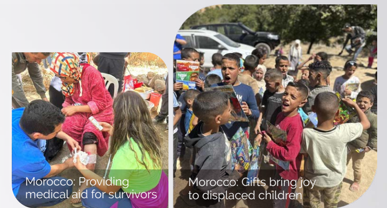
Morocco: Providing medical aid for survivors