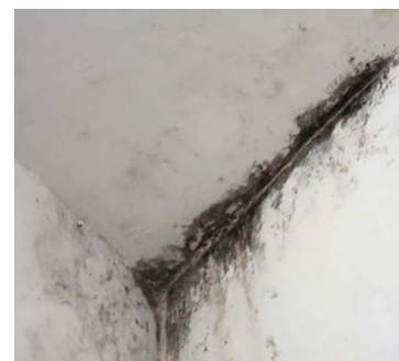
Photos: Living conditions of Syrian refugees in Lebanon