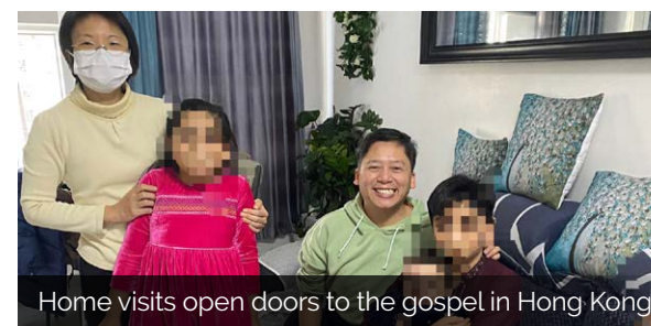
Home visits open doors to the gospel in Hong Kong

These outreach teams are equipped through discipleship and evangelism training events that are held four times a year. In the last 12 months, HIA has trained more than 100 people to effectively reach Muslims. Pray for salvation for the many Muslim families in the area, and for new believers to grow in discipleship.