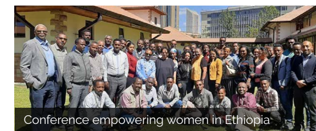
Conference empowering women in Ethiopia

The message was well-received, with many attendees realizing the importance of equipping women in their congregations to serve amongst Muslims. Some reported that they now felt compelled to reach Muslim women in their communities for Christ. Christians from Muslim backgrounds also shared how they were encouraged to persevere in witnessing to Muslims despite persecution!