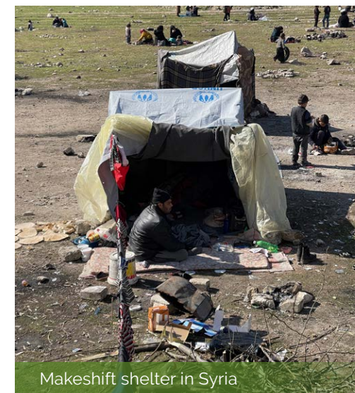
Makeshift shelter in Syria

The earthquakes that have so powerfully impacted Syria and Turkey struck at the intersection of three tectonic plates. The Arabian plate is moving northwards into Europe, pushing the Anatolian plate (where Turkey is located) westwards into the African plate. This movement builds up pressure along the fault zones, and the sudden release of this pressure has caused the earthquakes which devastated large swathes of Turkey and Syria.