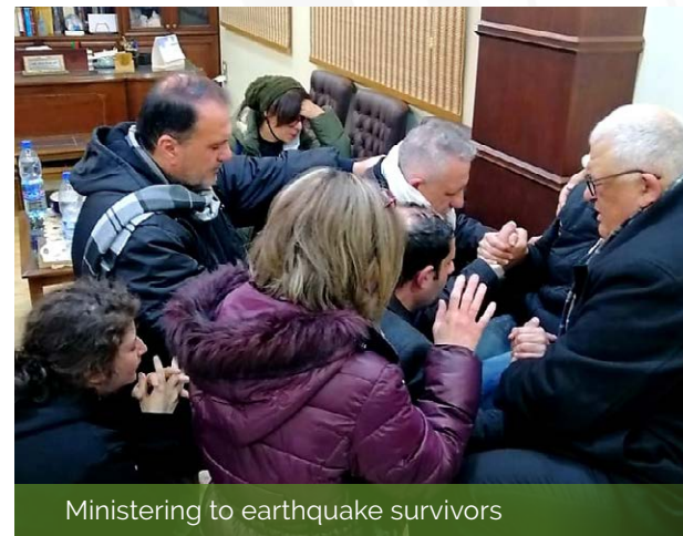
Ministering to earthquake survivors

Haggai 2:6 says: "I will once more shake the heavens and the earth, the sea and the dry land... I will shake all nations, and the desire of all nations will come "—that is Jesus. When people are shaken through pain, struggles, and suffering, they are more receptive to God.