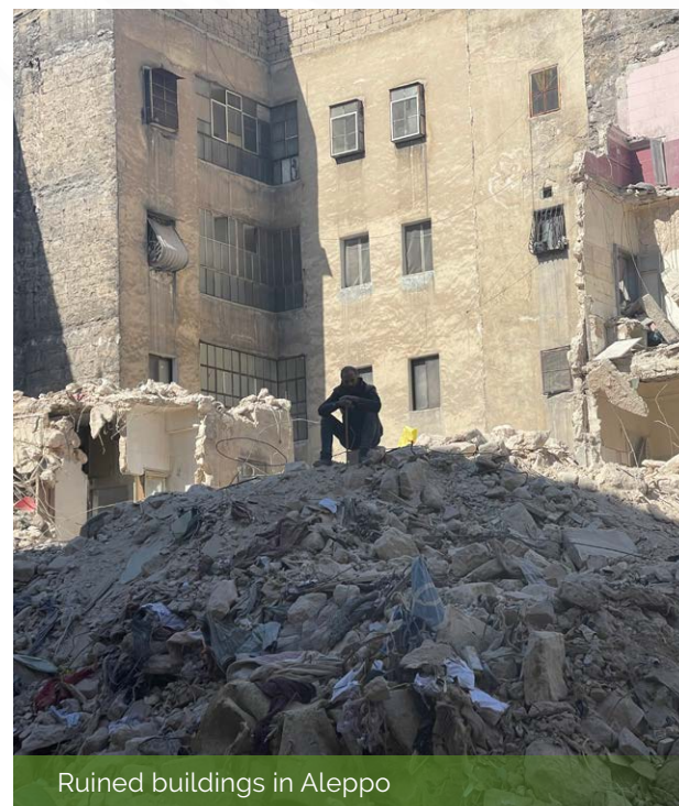
Ruined buildings in Aleppo

Though our hearts grieve with those who are suffering, we can also rejoice with those who are being saved, and join the Lord with anticipation as coworkers for his Kingdom. This is an extraordinary moment in time for us to be the hands and feet of Jesus.