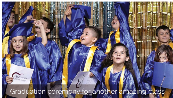
Graduation ceremony for another amazing class

After adding the 8th grade this year, we are up to over 150 students and 17 staff members. Please pray as we continue to work with these precious children. We have great faith that as they grow in education and in faith, they will continue to bring change to their families, communities, and countries, in the name of Christ Jesus.