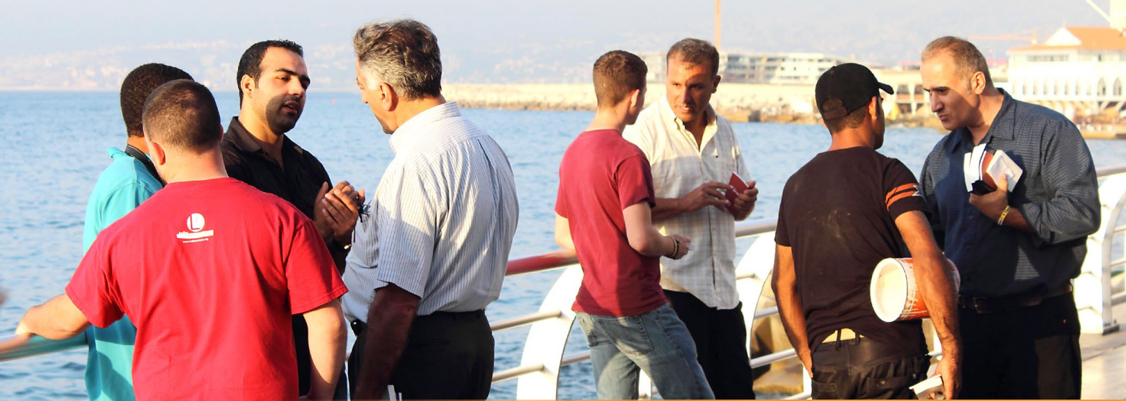
Evangelism in Rawshe - Lebanon