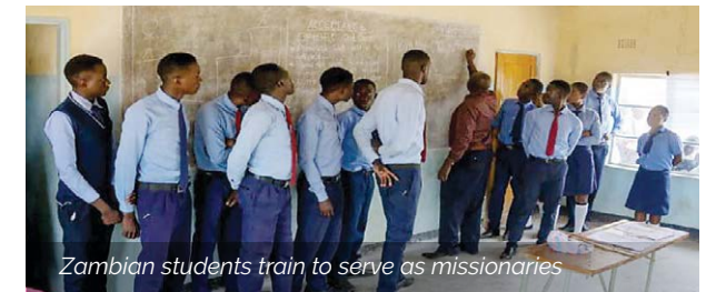
Zambian students train to serve as missionaries

Horizons' ministry partner World Outreach Team Action (WOTA) is equipping educational leaders for Bible teaching through a program that aims to train 960 educators in 2022. The training sessions will take place in four districts in the North-Western province, with over 100 people attending each session. In addition, WOTA is establishing weekly Bible Clubs in local public schools that will enable ministry leaders to connect with and disciple students. ICS Bible Clubs will be launched in 10 schools at the beginning of 2022, and will expand as funding allows.