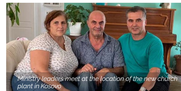
Ministry leaders meet at the location of the new church plant in Kosovo

The Messiah Evangelical Fellowship (MEF) network in Kosovo just added a new church plant in Gjakova, one of the largest cities in Kosovo! This church plant serves roughly 20 Muslim-background members who meet regularly in their homes. Additionally, this longtime partner church just celebrated their 27th anniversary, and hosted other events such as a Harvest Festival that provided opportunities for fellowship and outreach. They have also launched a new class for theological studies, which currently serves 17 students through teaching and discussions.